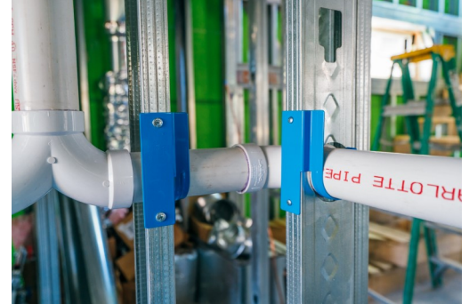
Inside of the wall: Holds and Protects pipes and can be used with both wood or metal studs