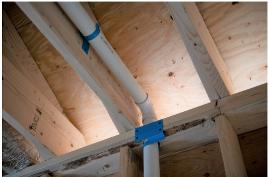
For installation applications that need to be mounted on beams or joists