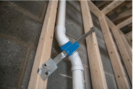
Highly versatile: Secures pipes in a wide variety of locations and positions