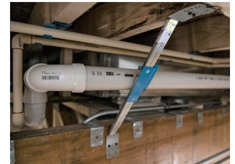
Overhead pipe installation in-between joists and beams