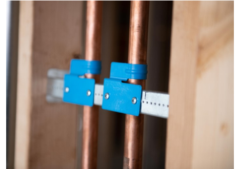
Vertical pipe installation in-between studs